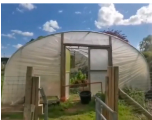
Allotment / Polytunnel