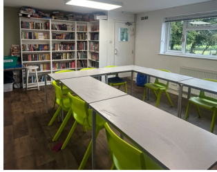
Dining Room / English / Library