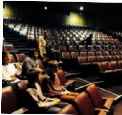
TRIP TO FARER THEATRE