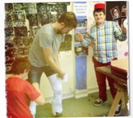
DAY AT THE MUSEUM